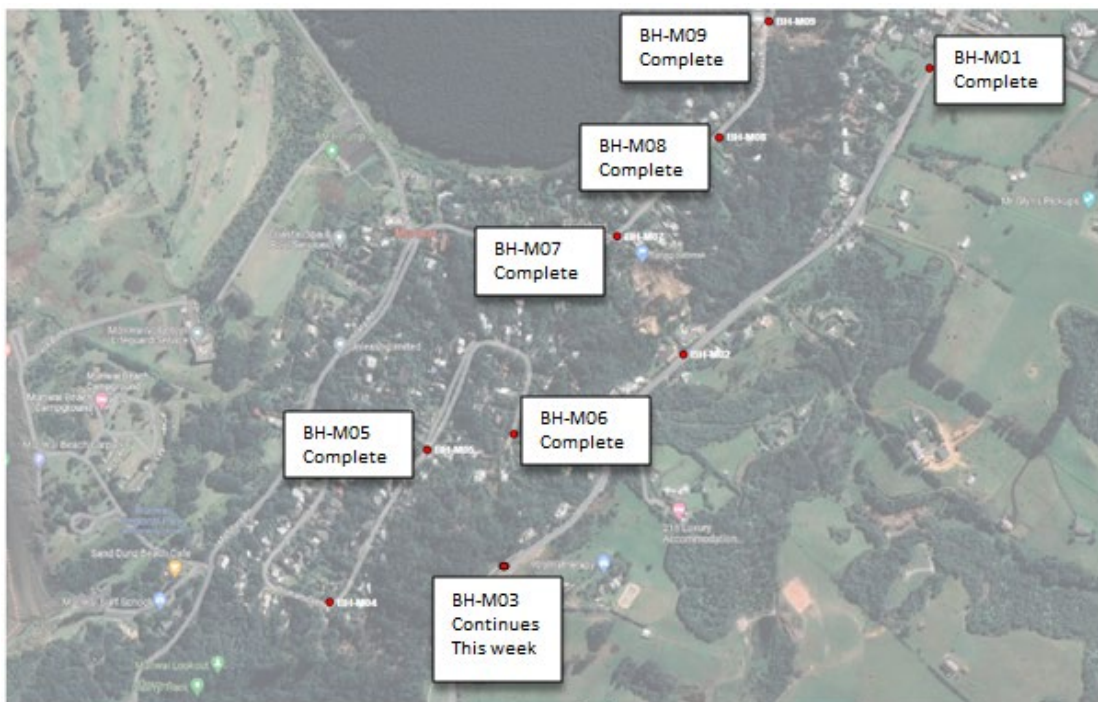
Drilling locations ( Red dots).

Currently completed locations are BH-M01 (Oaia Road) and BH-M08, BH-M07, BH-M09 (Motutara Road), BH-M05 and BH-M06 (Domain Crescent) and are currently continuing drilling BH-M02 (Oaia Road) (see below image).