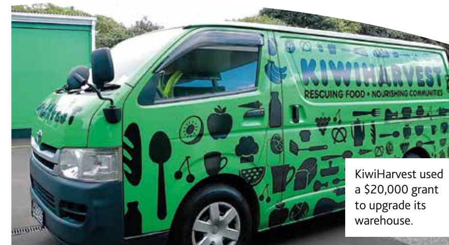
KiwiHarvest used a $20,000 grant to upgrade its warehouse.

"These ideas are exciting and play an important part in Auckland becoming a zero-waste city by 2040," she says.