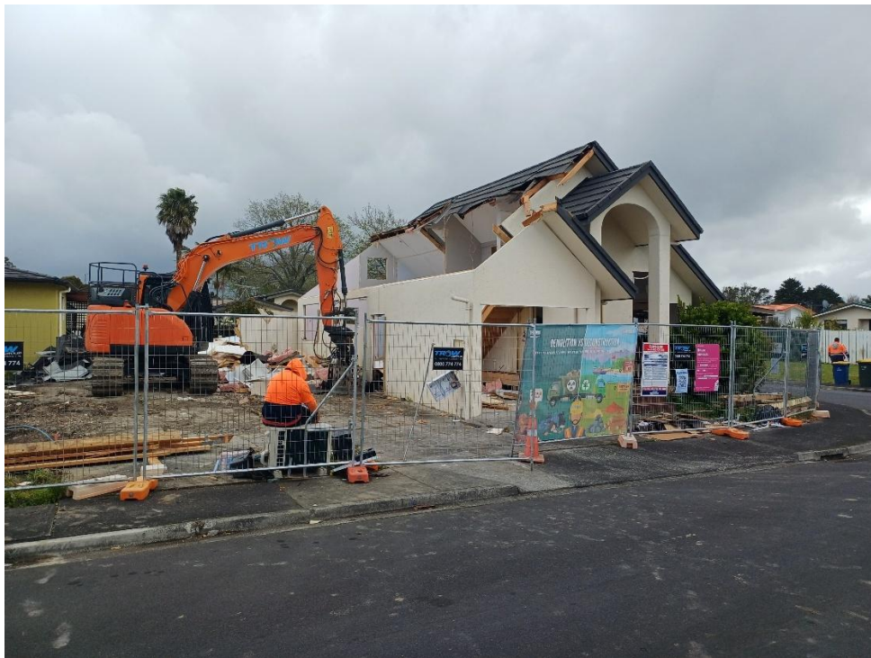
Mechanical deconstruction in action

Once all recoverable material has been removed by hand, machinery will arrive and complete the mechanical deconstruction. This typically involves a 12-tonne digger. After the concrete slab has been removed, the final crew will spread topsoil and grass seed across the site.