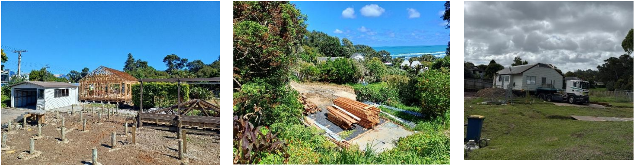
Different stages of house removal

You may notice different crews arriving at different stages and there may be short gaps between them - this is normal and expected. If a crew packs up and leaves and the site doesn't look finished, please don't be concerned. A further crew will be scheduled to complete the ground remediation. The job is not complete until topsoil and grass seed have been spread.