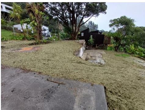
Concrete wall and slab left in place as acting as retaining (grass is still to establish)

All sites will be grassed and put onto a monthly maintenance schedule.