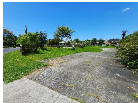
Driveways are usually left in place and sites have a lower level of maintenance than what you may be used to.