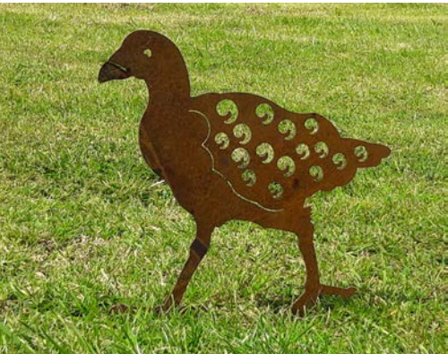
Optional: Wetland birds Corten cutouts

Date: 20 April 2021 Plan prepared for Auckland Council by Boffa Miskell Limited PM: aynsley.cisaria@boffamiskell.co.nz Drawn: ACi | Checked: SCo