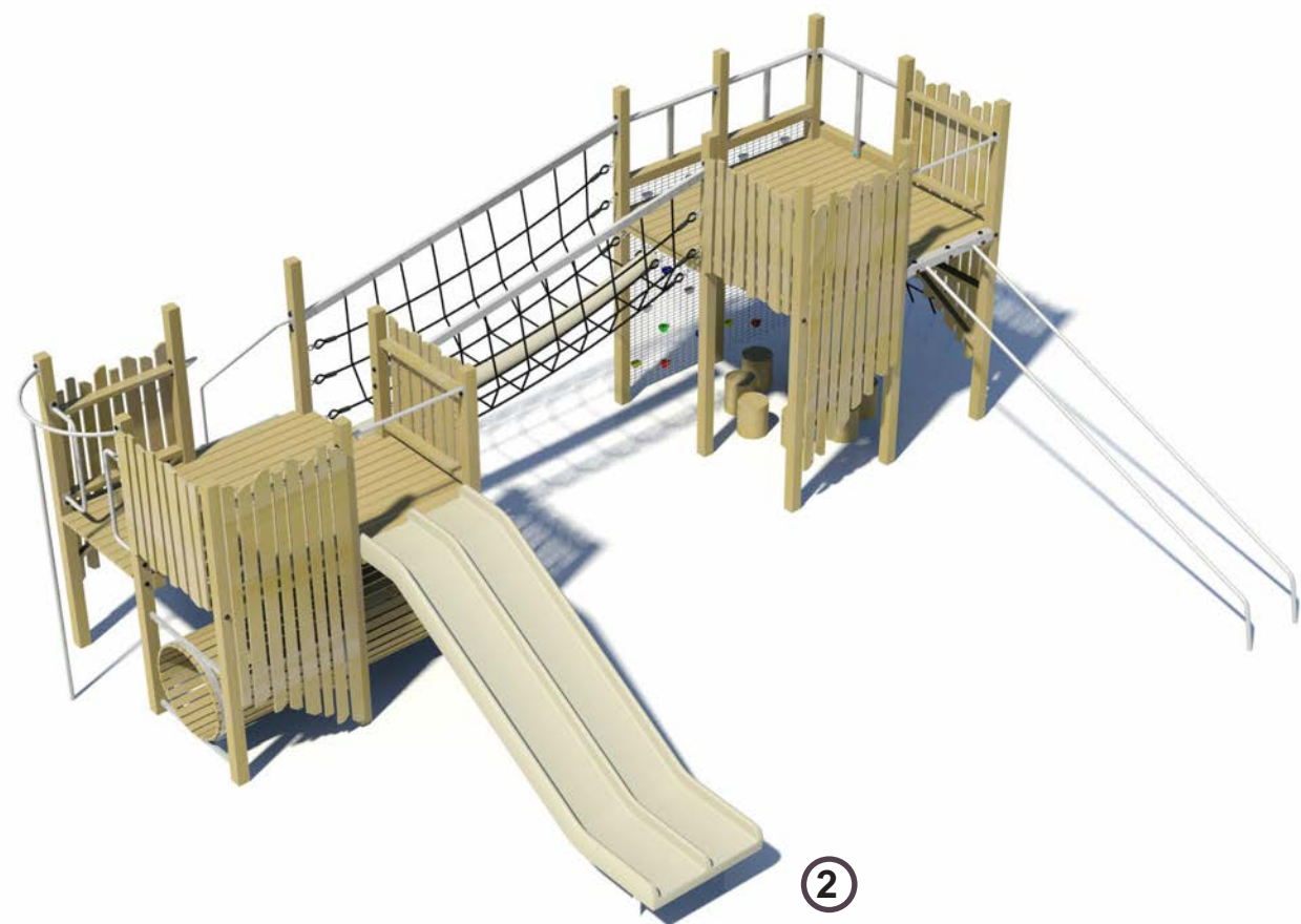
Front view of bespoke timber climbing module