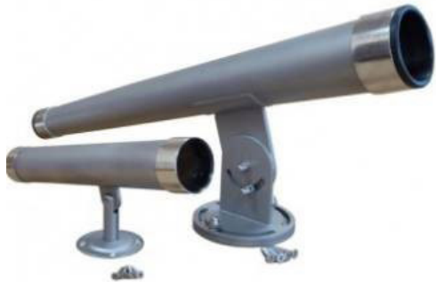
Optional: Telescope for bird-watching