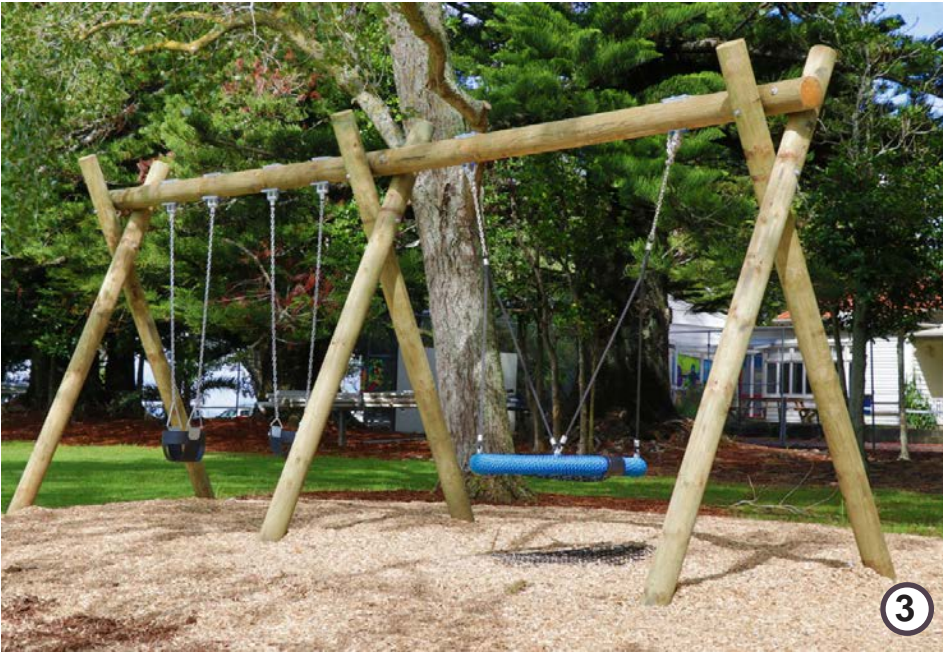
2-bay traditional swings with basket